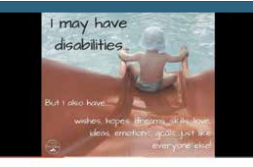
"I Can" Project Celebrating Individuals with Intellectual and Developmental Disabilities.

The video was shared on social media and with agencies and schools in our