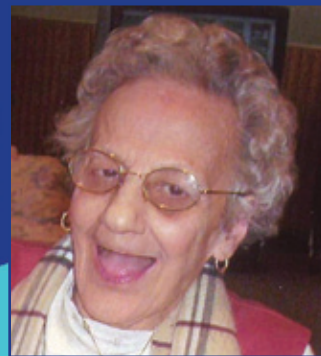
Vera Pannacci's Story is on page 6

The Arcticulate is a publication for employees and friends of The Arc of Northeastern Pennsylvania