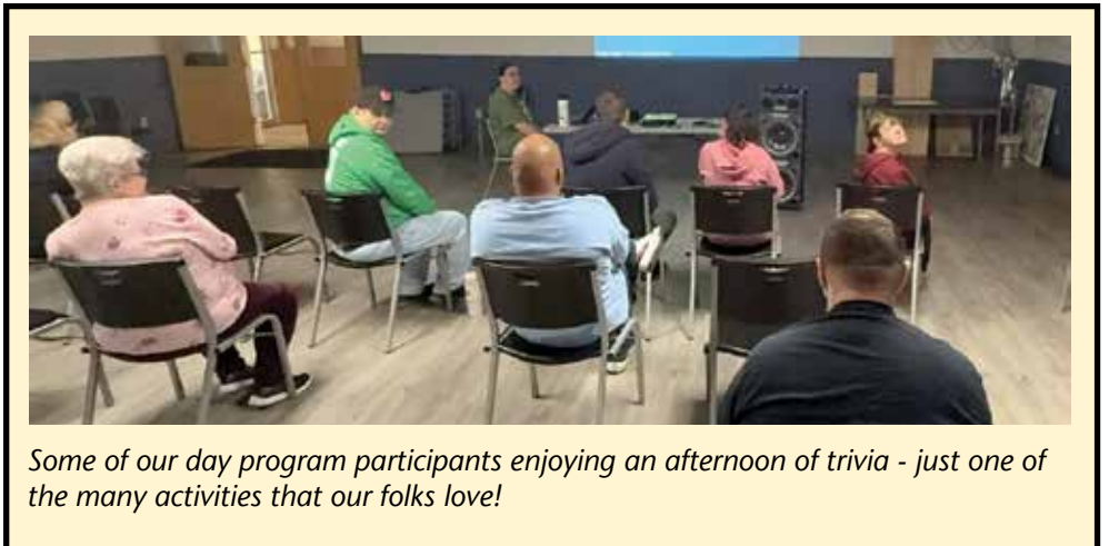
Some of our day program participants enjoying an afternoon of trivia - just one of the many activities that our folks love!