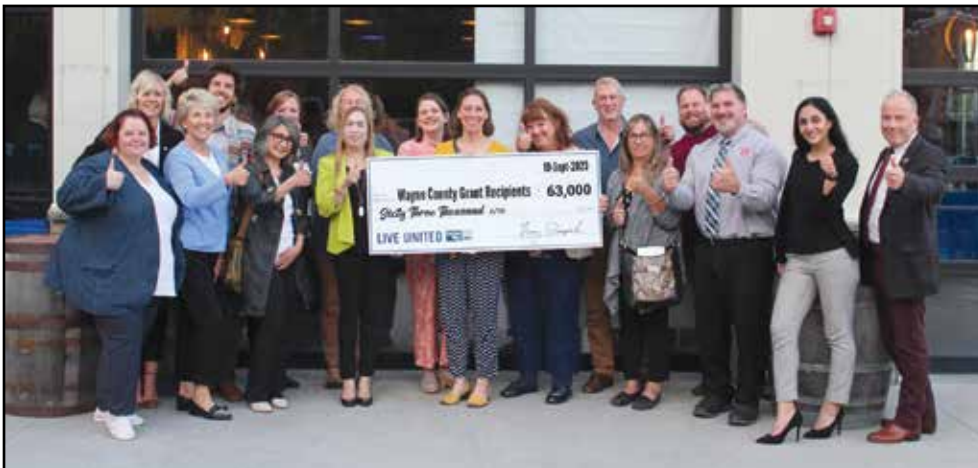
What an amazing night at a fabulous venue Wallenpaupack Brewing Company with wonderful people United Way of Lackawanna and Wayne Counties and Pike and many terrific folks from the community! We are so very grateful for the support we have received for people with intellectual and developmental disabilities. Your kindness and compassion means the world to us.