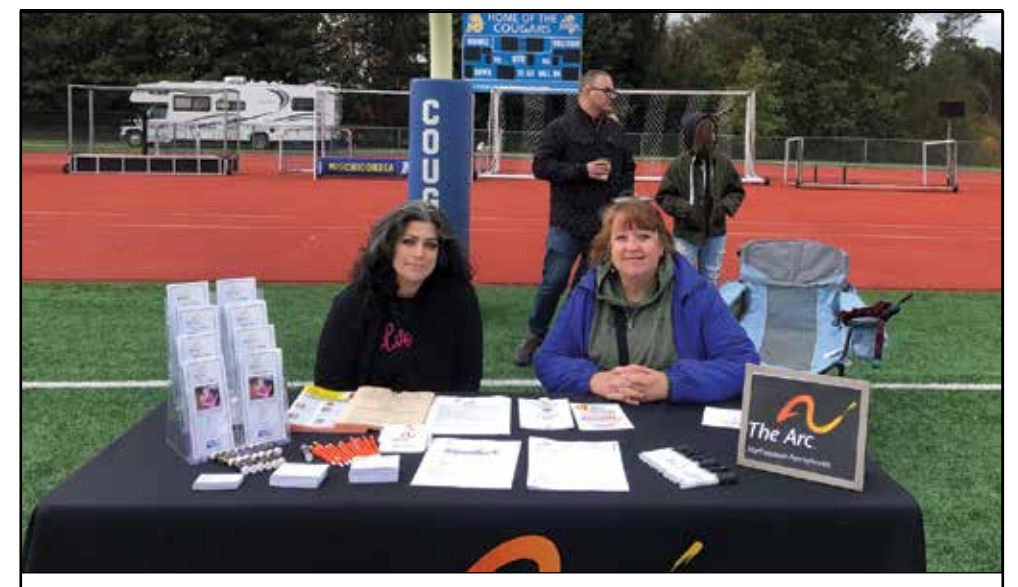
The Arc-NEPA joined in the fun at the Buddy Walk at Misericordia University (Mangelsdorf Field) in Luzerne County on October 8th. The Misericordia University Physical Therapy Club and the Luzerne County Down Syndrome Network hosted a non-competitive one-mile, live music, food trucks, 50/50 raffle and basket raffle.