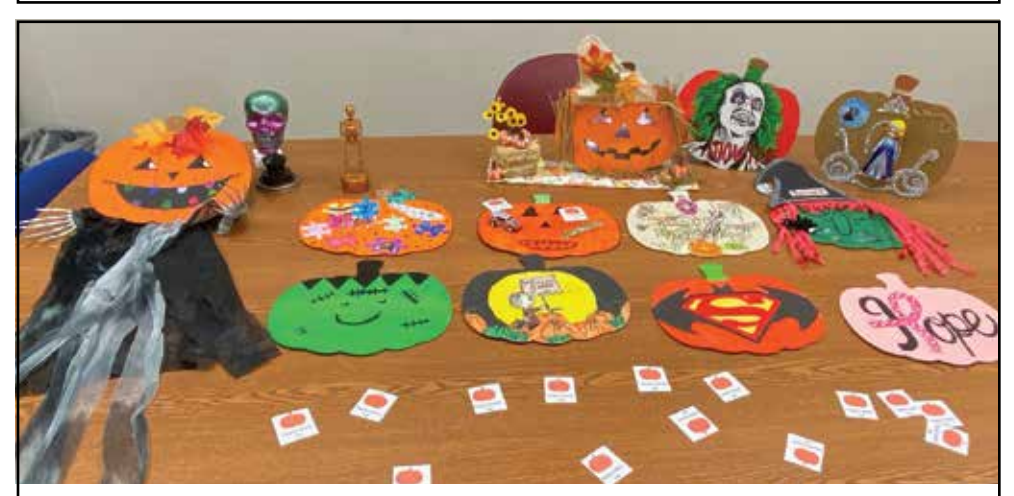
How about these awesome pumpkins?!?!?! As you can tell, there is a lot of talent here at The Arc and we think everyone did such a great job.