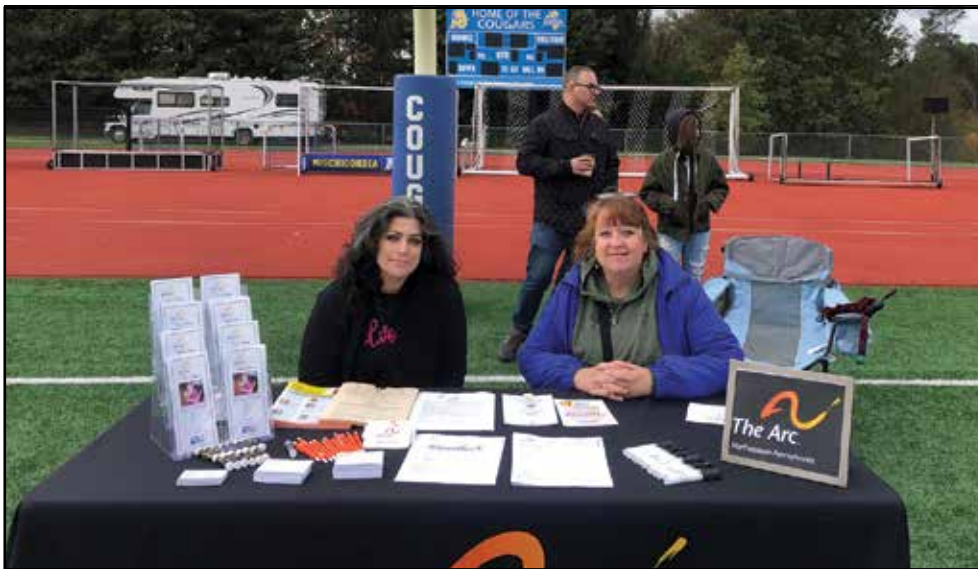
The Arc-NEPA joined in the fun at the Buddy Walk at Misericordia University (Mangelsdorf Field) in Luzerne County on October 8th. The Misericordia University Physical Therapy Club and the Luzerne County Down Syndrome Network hosted a non-competitive one-mile, live music, food trucks, 50/50 raffle and basket raffle.