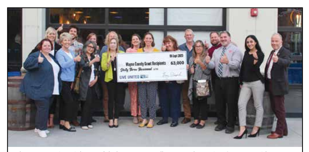
What an amazing night at a fabulous venue Wallenpaupack Brewing Company with wonderful people United Way of Lackawanna and Wayne Counties and Pike and many terrific folks from the community! We are so very grateful for the support we have received for people with intellectual and developmental disabilities. Your kindness and compassion means the world to us.