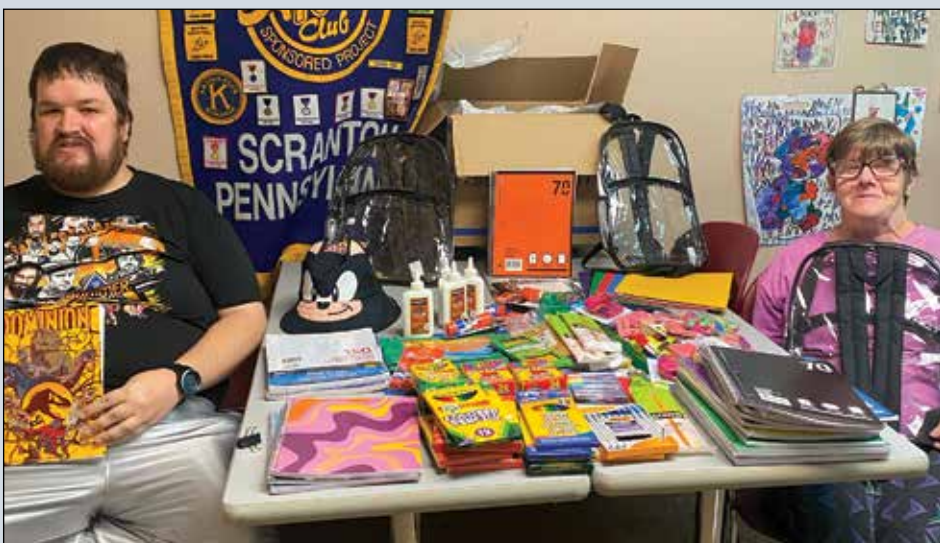
The Aktion Club gathered and donated school supplies which were donated to Outreach-Center for Community Resources in Scranton. Outreach distributed the supplies to children in Scranton during its Children's Career Fair.