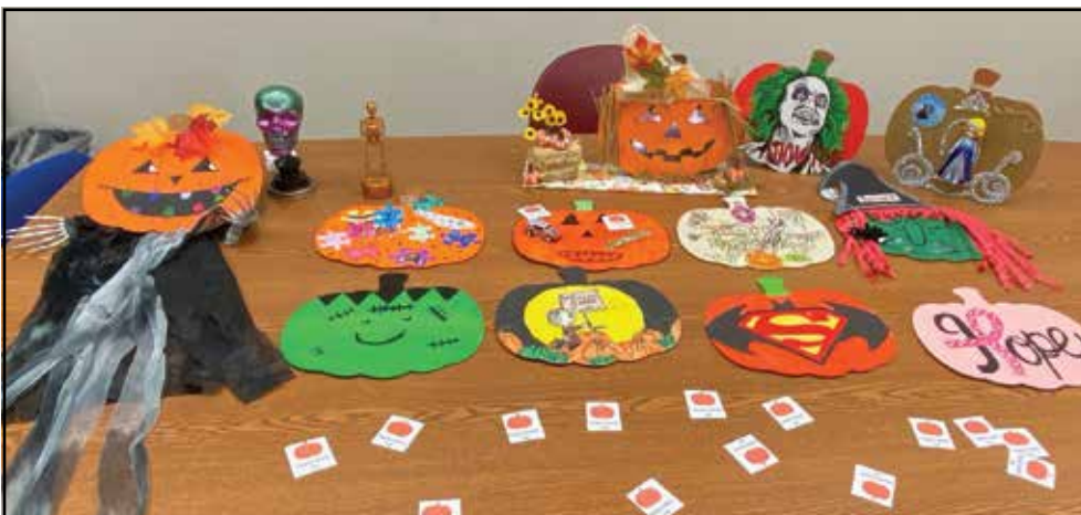
How about these awesome pumpkins?!?!?! As you can tell, there is a lot of talent here at The Arc and we think everyone did such a great job.

Leaving a Legacy... By giving a gift to The Arc, you are ensuring a bright future for the people served in our programs. Estate giving allows for a variety of ways for individuals to choose the support most appropriate for planning their legacy: Outright cash gifts, designated life insurance policy, bequests, real estate.